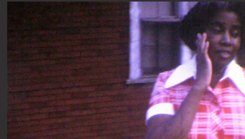
3. William M. Morris (American, b. 1960) Immediacy of Distance , 2015 Video, 22:40 min.