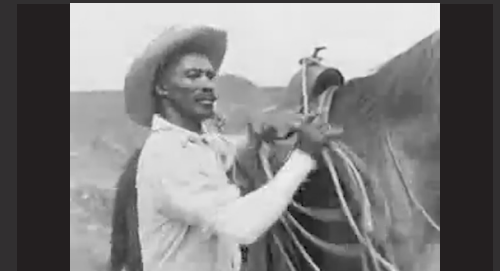
6. Charles Lee (American, b. 1983) Been here! , 2023 Video, 7:52 min. Courtesy of the artist