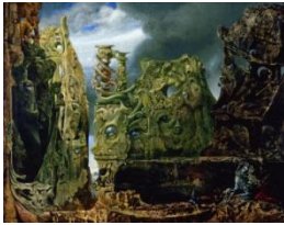
Max Ernst (German, 1891–1976) L'oeil du silence (The Eye of Silence) , 1943–44 Oil on canvas, 43 1/4 x 56 1/4" University purchase, Kende Sale Fund, 1946 WU 3786