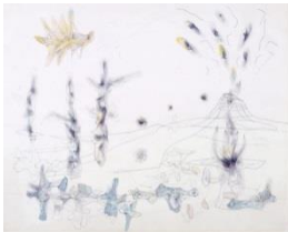
Roberto Matta (French, b. Chile, 1911–2002) Lambeaux Iron-Oniriques (Iron-Oneiric Scraps) , 1942 Pencil and crayon University purchase, Kende Sale Fund, March 1946 WU 3788