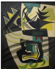
Werner Drewes (American, b. Germany, 1899–1985) Re-awakening , 1943–47 Oil on canvas, 48 x 38 1/4" University purchase WU 3815