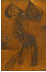
Stanley William Hayter (British, 1901–1988) Printing plate for Amazon , 1945 Copper etching plate, 25 x 16" University purchase, Kende Sale Fund, 1946 WU 3791