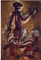
André Racz (American, b. Romania, 1916–1994) Perseus Beheading Medusa, VIII , 1945 Engraving with aquatint, 26 1/8 x 18 1/4" University purchase, Kende Sale Fund, 1946 WU 3794