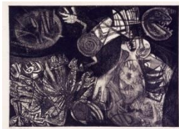
Reuben Kadish (American, 1913–1992) Job , 1945 Engraving with aquatint, trial proof, 12 3/16 x 17 3/4" University purchase, Kende Sale Fund, 1946 WU 3795