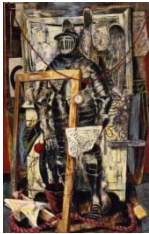
Karl Zerbe (American, b. Germany, 1903–1972) Armory , 1943 Encaustic on canvas, 62 1/2 x 40" University purchase, Kende Sale Fund, 1946 WU 3780