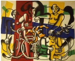
Fernand Léger (French, 1881–1955) Les belles cyclistes (The Women Cyclists) , 1944 Oil on canvas, 29 x 36" Gift of Charles H. Yalem, 1963 WU 4185