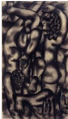
Fernand Léger (French, 1881–1955) Les grands plongeurs (The Divers) , 1941 Charcoal and ink wash with white heightening on paper, 75 3/8 x 41 7/8" University purchase, Kende Sale Fund, 1946 WU 3784