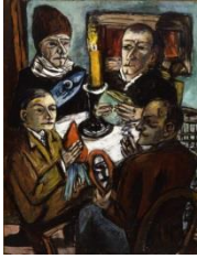
Max Beckmann (German, 1884–1950) Les artistes mit Gemüse (Artists with Vegetable) , 1943 Oil on canvas, 58 15/16 x 45 3/16" University purchase, Kende Sale Fund, 1946 WU 3789