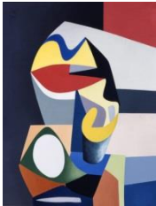
Jean Hélion (French, 1904–1987) Rouge Brilliant , 1938 Oil on canvas, 46 3/16 x 35 1/4" University purchase, Kende Sale Fund, 1946 WU 3777