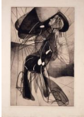
Stanley William Hayter (British, 1901–1988) Amazon , 1945 Engraving and etching, 30 x 22 1/8" University purchase, Kende Sale Fund, 1946 WU 3792