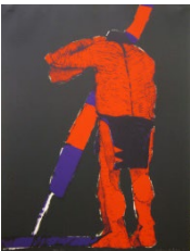
Fritz Scholder (American, 1937–2005) The Odyssey #2 , 1976–77 Lithograph, 30 1/4 x 22 1/2 in. Gift of Wanda and Thomas Taylor, 1981 WU 1981.29