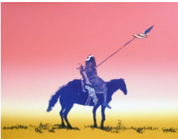
Fritz Scholder (American, 1937–2005) Indian with Flag , 1973 Lithograph, 30 x 39 in. Gift of Charles J. Weinraub, 1982 WU 1982.11