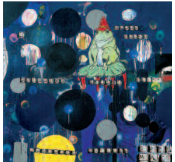
Under the Killing Moon (... Spilling and Spilling... There Was a Point Where No One Resisted) , 2004. Mixed media on canvas, 98 1/16 x 102" (249 x 259 cm). Goetz Collection, Munich.