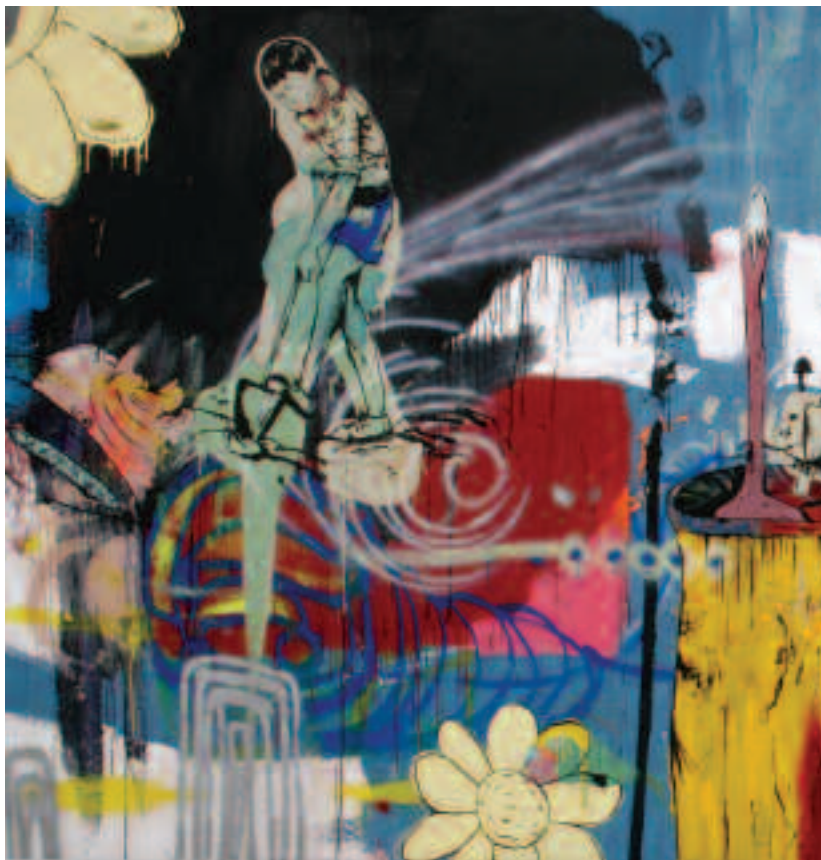
The Doppelganger's Boneyard , 2007. Mixed media on canvas, 98 13 / 16 x 264 1 / 16 ” (251 x 671 cm).