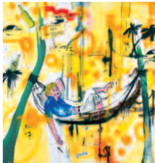
Absolutes and Nothings , 2001. Mixed media on canvas, 86 5 / 8 x 83 1 / 16 " (220 x 211 cm). Private collection, Los Angeles.

Thaddeus Strode: Absolutes and Nothings features twenty-three large-scale mixed-media paintings dating from 2001 to the present. Strode's paintings are primarily executed using the fast medium of acrylic paint. His work is compatible with the experience of a dense and fast-paced present yet there is an underlying opposition running throughout his compositions between fast painting and slow viewing . In contrast to his rapid working process, the various methods of abstract painting Strode employs—as well as the inclusion of a diversity of figurative elements—call for a prolonged viewing process that slowly reveals and uncovers.