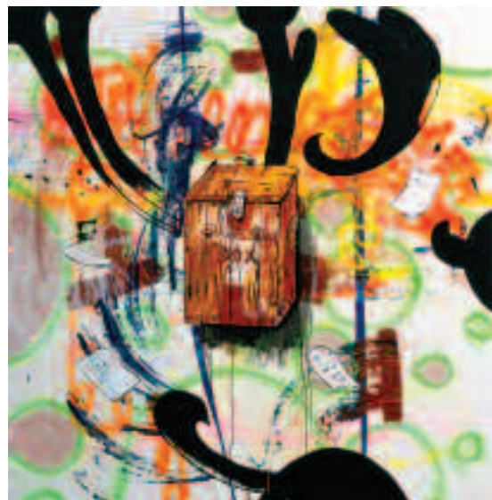
Suggestion Box , 2005. Mixed media on canvas, 83 1 / 2 x 81 15 / 16 ” (212 x 208 cm). Private collection, St. Louis.