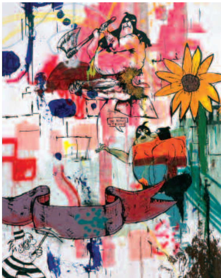
Executioners and Prisoners (Praise for the Morning), 2007. Mixed media on canvas, 97 11 / 16 x 77 9 / 16 " (248 x 197 cm).