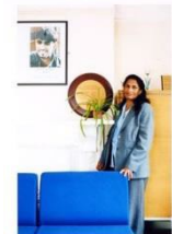
Wolfgang Tillmans (German, b. 1968)

Su Khedev Reel , from the Portrait series, 2000