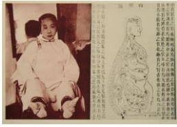
Hung Liu (Chinese, b. 1948)