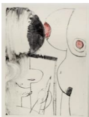
Nicole Eisenman (American, b. France, 1965)