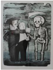
Nicole Eisenman (American, b. France, 1965)