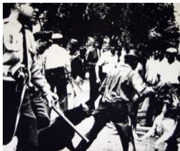
Andy Warhol (American, 1928–1987) Birmingham Race Riot , from the portfolio X + X (Ten Works by Ten Painters) , 1964 Screen print, 219/500, 20 x 24" University acquisition, 1970 WU 4233 E