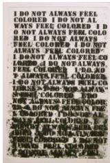
Glenn Ligon (American, b. 1960) Untitled (Two White/Two Black) , 1992 Softground etching, aquatint, spit bite, and sugarlift, 25 1/8 x 17 1/2" (each) University purchase, Charles H. Yalem Art Fund, 1997 WU 1997.04-.09