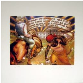
Luis Jimenez (American, b. 1940) The Mass of Mankind... Thomas Jefferson Quote , from the portfolio 10: Artist as Catalyst , c. 1992 4-color serigraph, 53/100, 26 x 26" University purchase, 1994 WU 1994.07.04