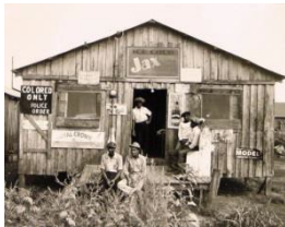
Madeline Osborne (American) A Shack for Negroes Only at Belle Glade, FLA. , 1945 Gelatin silver print, 8 1/4 x 10" University purchase, St. Louis Printmarket Fund, 1993 WU 1993.6