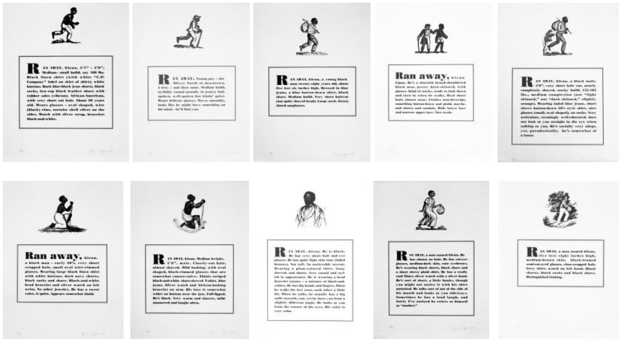
Glenn Ligon (American, b. 1960) Runaways , 1993 Portfolio of 10 lithographs, 30/45, 16 x 12" (each) University purchase, Nathan Cummings Fund and Art Acquisition Fund, 1996 WU 1996.01.01-.10