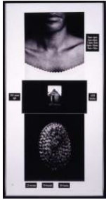
Lorna Simpson (American, b. 1960) Counting , 1991 Photogravure and screen print, 48/60, 73 3/8 x 38" University purchase, 1992 WU 1992.22